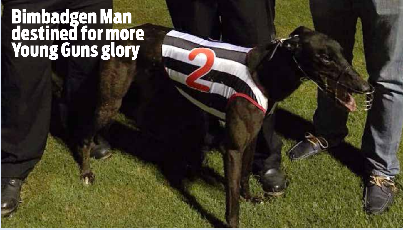
Townsville Young Guns finalist Bimbadgen Man.

BIMBADGEN Man (Fabregas x Taros Miss Aug '15) will be the one to beat in the RQ Townsville Young Guns (498m) this Tuesday night after coming up with the coveted rails alley for the $3,500 to the winner feature.