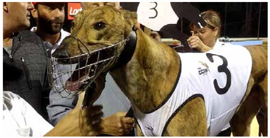
Tiempo Dinero headlines a massive weekend for his litter.