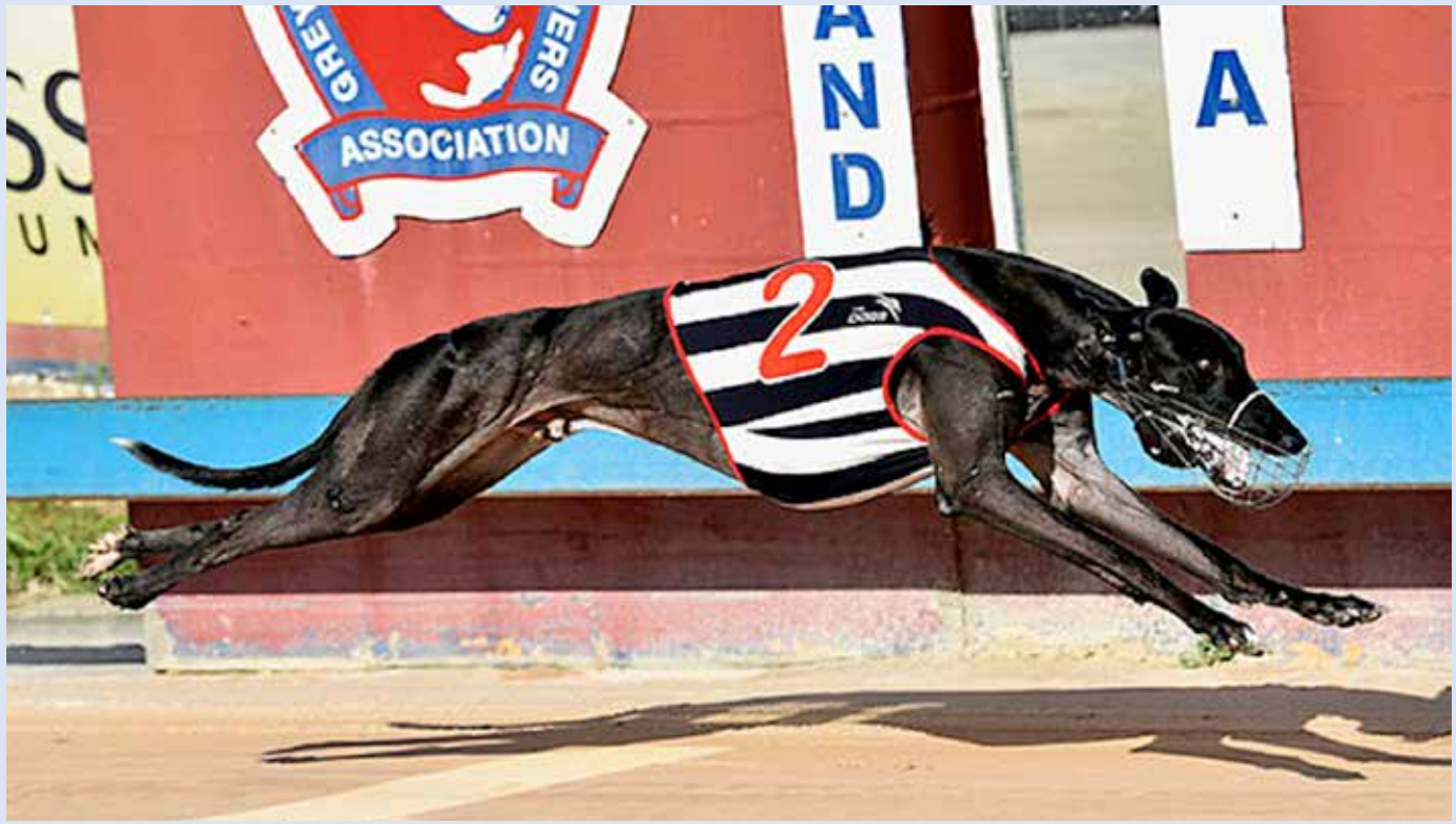
Lochinvar Hugo winning at Maitland.

REAKISH talent Lochinvar Hugo (Barcia Bale x Lochinvar Vogue Apr '15) is only weeks away from his return to the race track following an injury set back at the start of the year.