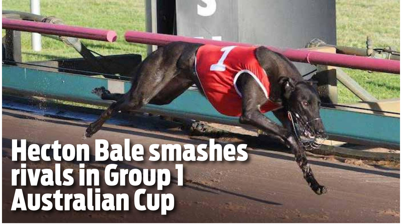
Hecton Bale wins at The Meadows.